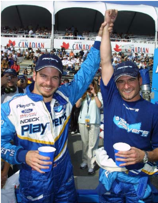
Before October 2003