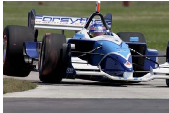
After October 1, 2003