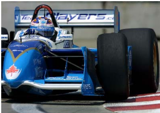
Before October 1, 2003