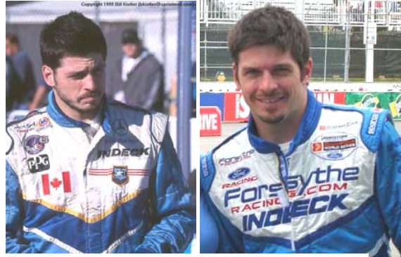
Before October 1, 2003

The Forsythe Player's Team was the flagship of Imperial Tobacco's promotional campaign for Player's cigarettes, and Imperial Tobacco purchased a 50% share in the company. Ten months after the supposed end of sponsorship, there are continued media reports that Imperial Tobacco is still a co-owner of the Forsythe Racing Team . In July 2004, the Toronto Star reported that "Imperial Tobacco, through Player's, still owns a 50 per cent share of Player's/Forsythe Racing." 3