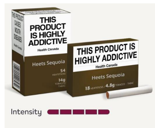
Figure 1: Package sizes for HEET products. 180 sticks (above) lists for $75 in Ontario and 54 sticks (below) lists for $28.50