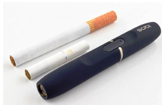
An IQOS device and HEETS stick (below and middle) and a conventional cigarette (above)