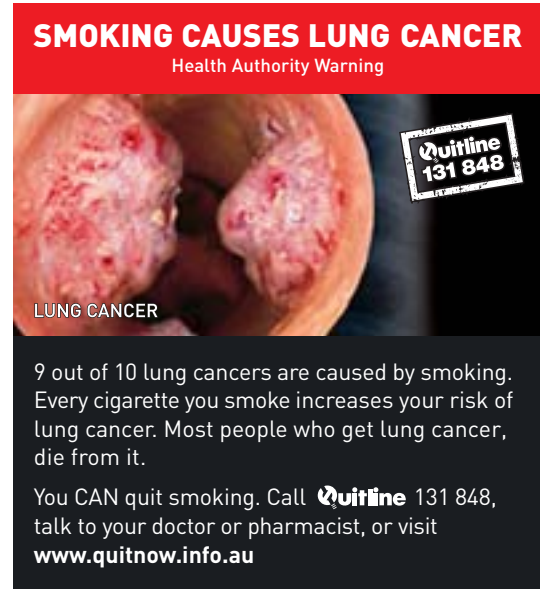
Back of Pack