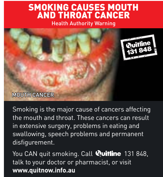
Back of Pack