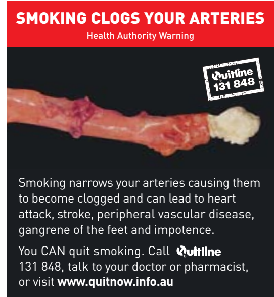
Front of Pack