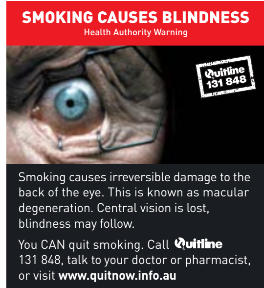
Back of Pack