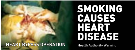
Front of Pack