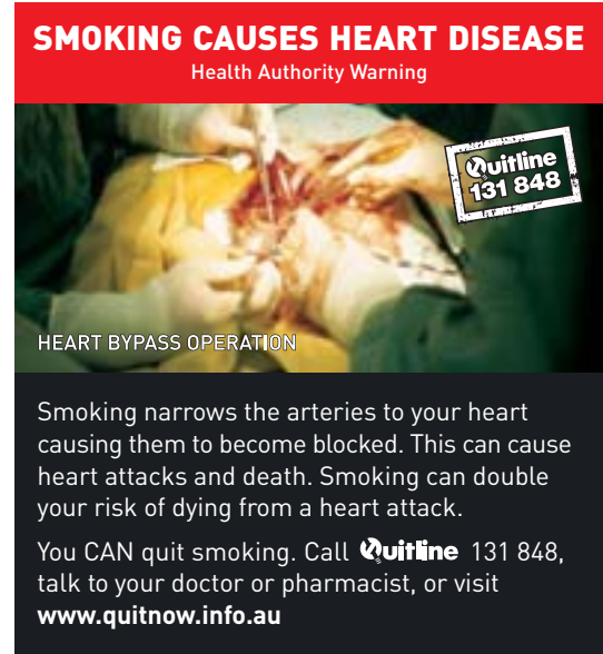
Back of Pack