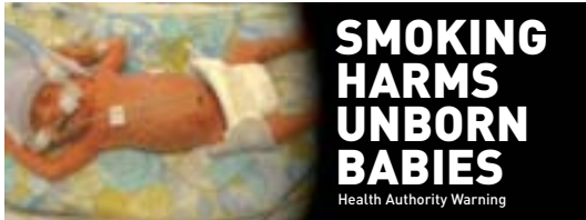
Front of Pack