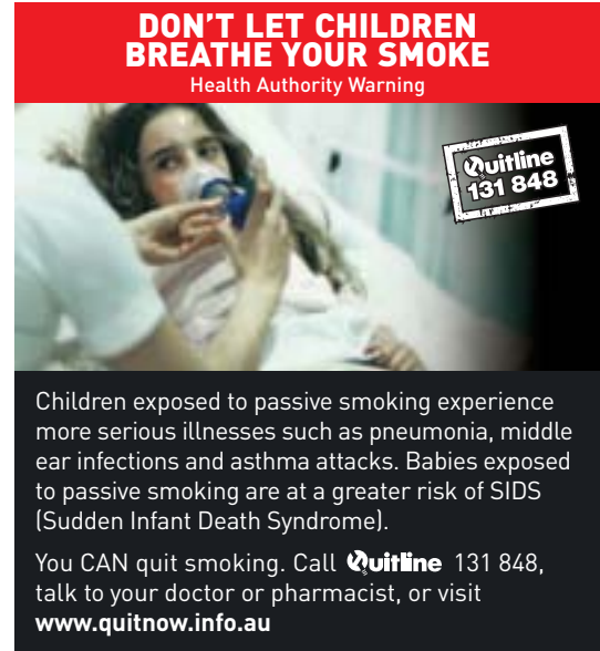
Back of Pack