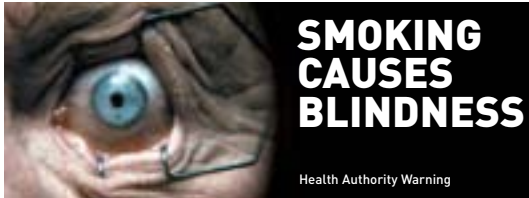
Front of Pack