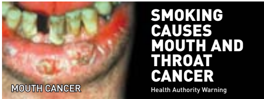
Front of Pack