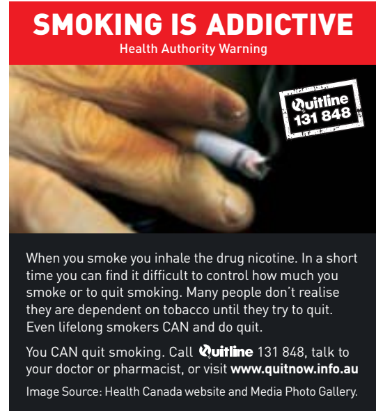
Back of Pack