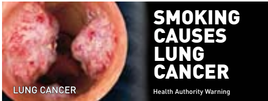
Front of Pack