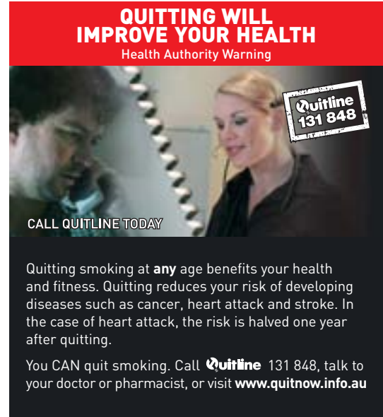
Back of Pack