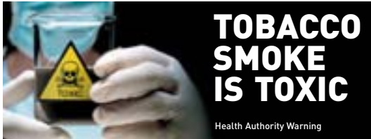
Front of Pack