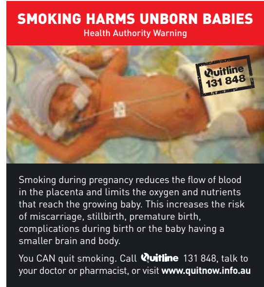
Back of Pack