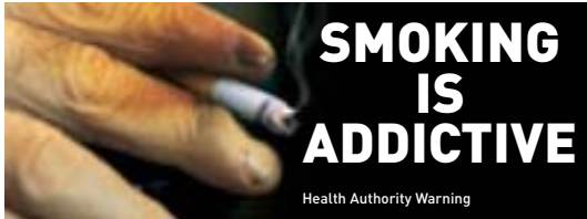
Front of Pack