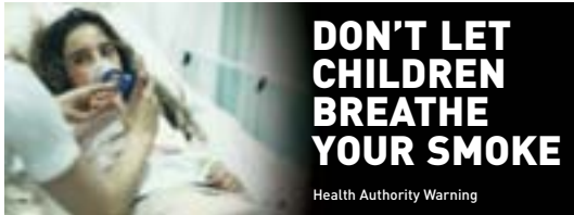
Front of Pack