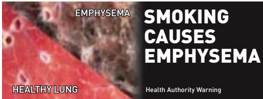
Front of Pack