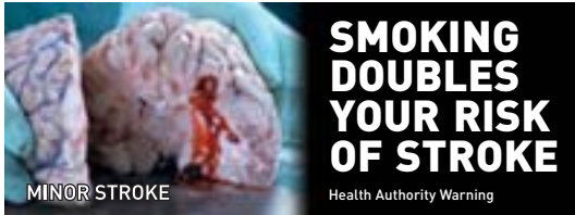
Front of Pack