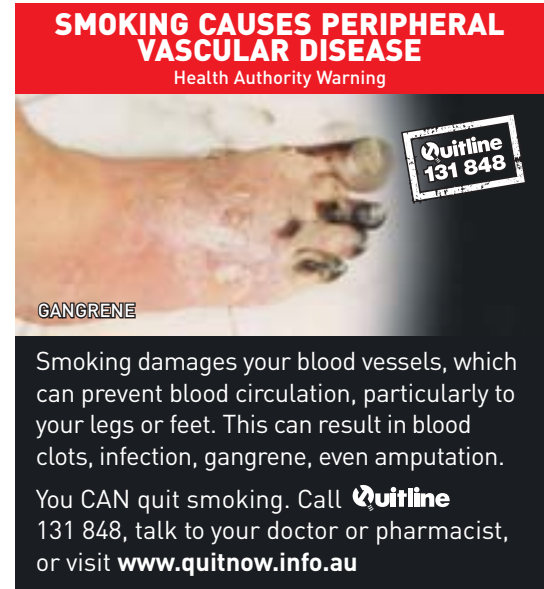
Front of Pack