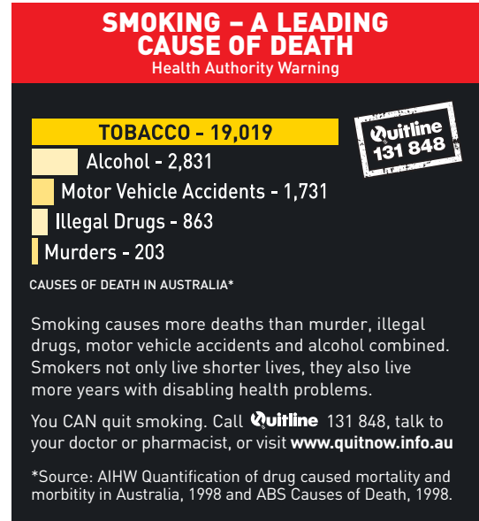
Back of Pack